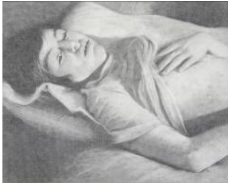
Paul P. Untitled , 2007