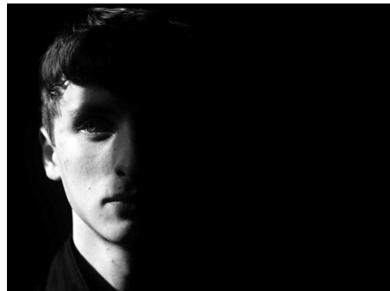
Hedi Slimane, Portrait, Untitled , 2007